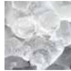
Chewblet® ice nuggets made by the Quench 985

Quench 985. Have a need for ice and water in the same machine? The space-saving Quench 985 is a smart-looking ice and water dispenser that produces high-quality Chewblet® nugget ice along with an endless supply of pure, fresh water. The Quench 985 is an attractive addition to any lunchroom, break room, healthcare environment, or other area where ice is desired.